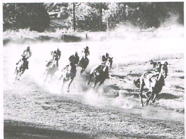
Action at the racecourse a week after the cross country event!