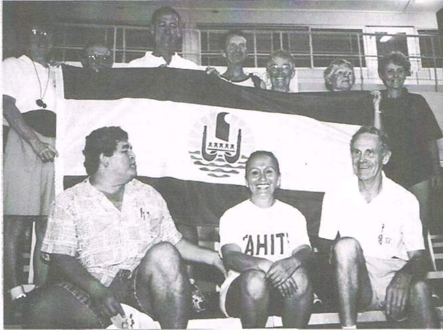
The Tahitian flag was passed on to the organisers of the next Oceania Games - in Hawkes Bay in 1998