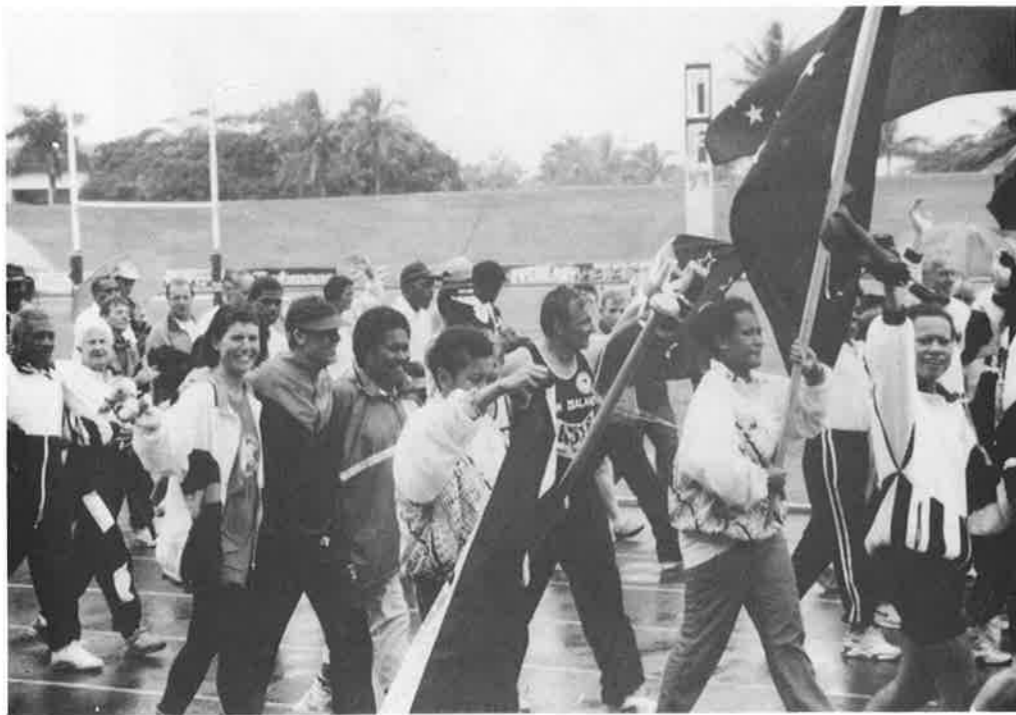
The wet weather did not dampen enthusiasm in the final march past of the Closing Ceremony