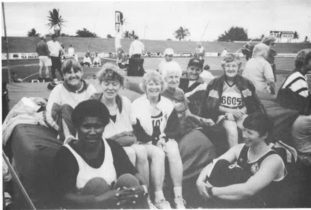
A happy group rests between field events